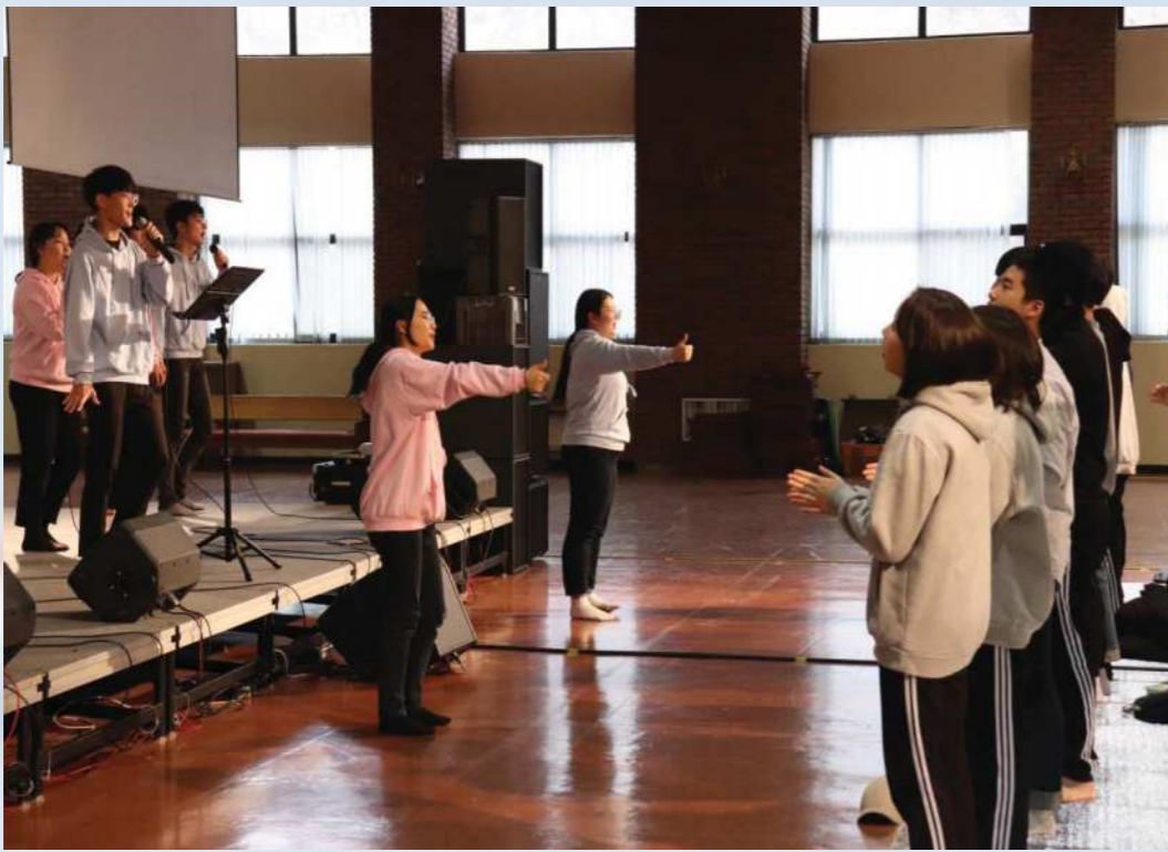
High School Group

Primary School / Junior-High School / High School / CBA Campus Mission Group / BWM Youth Group