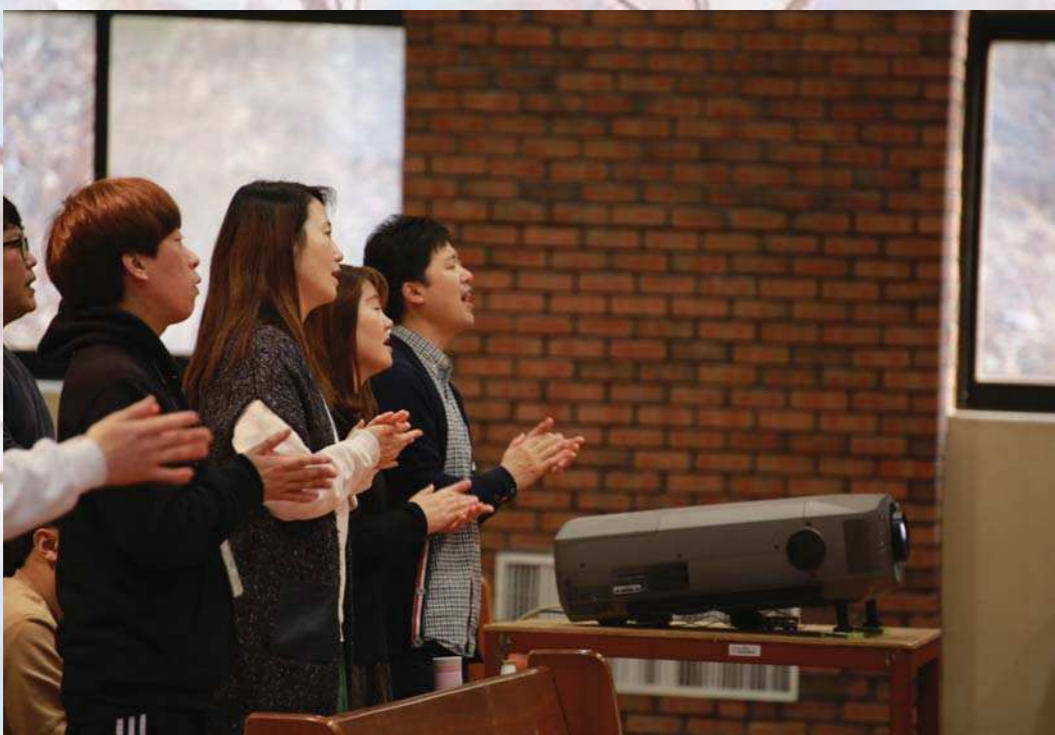
BWM Youth Group