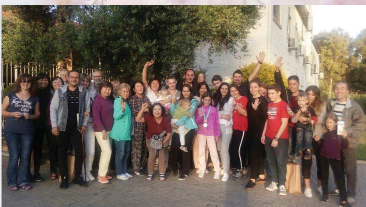
World Berean in Israel

At long last, the word of Berea is flowing into Israel by one true person who understands the blessing of God. Shall we expect that it will start to bless all people in Israel?