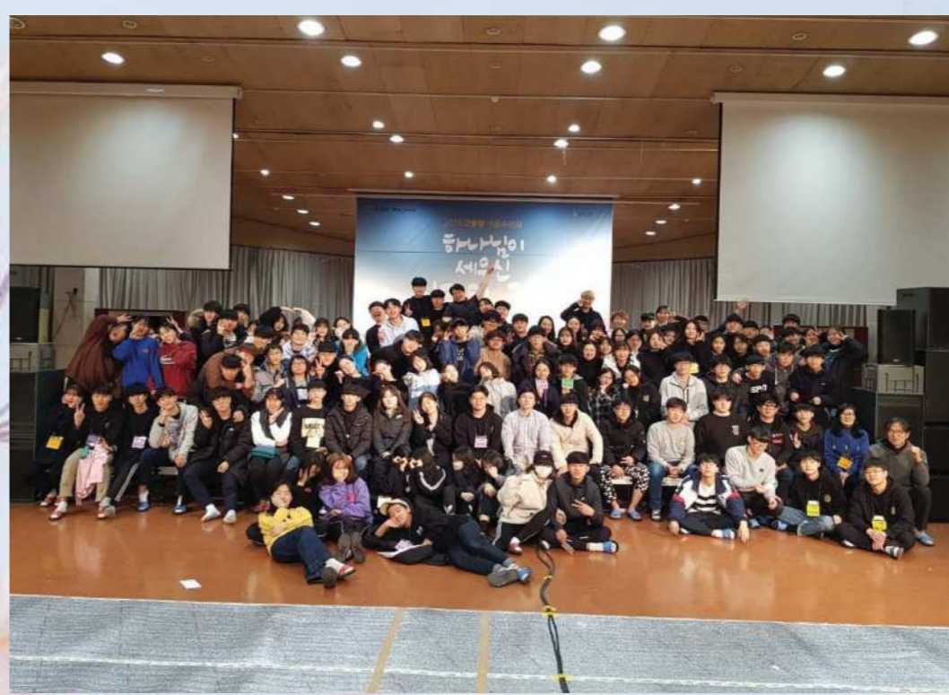
High School Group