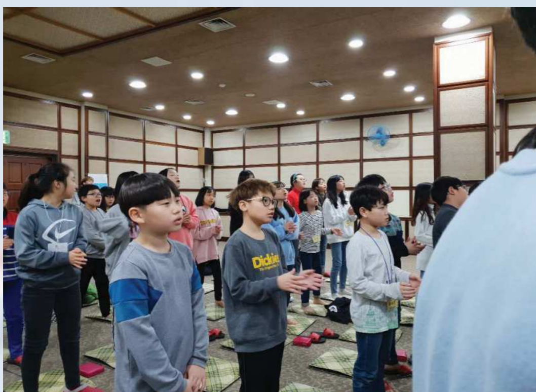
Primary School Group