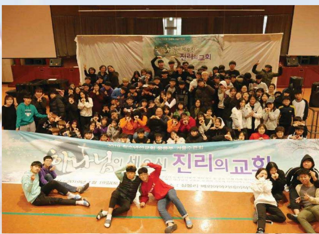
Junior-High School Group