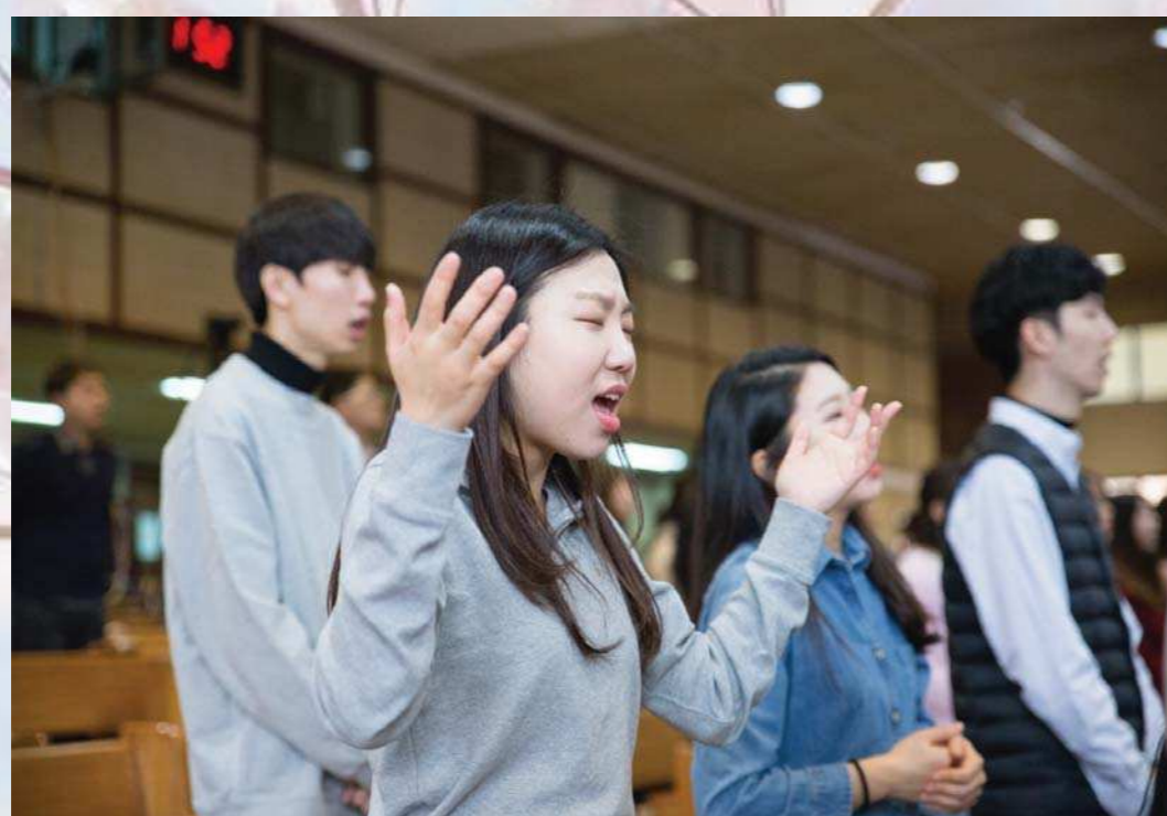
CBA Campus Mission Group