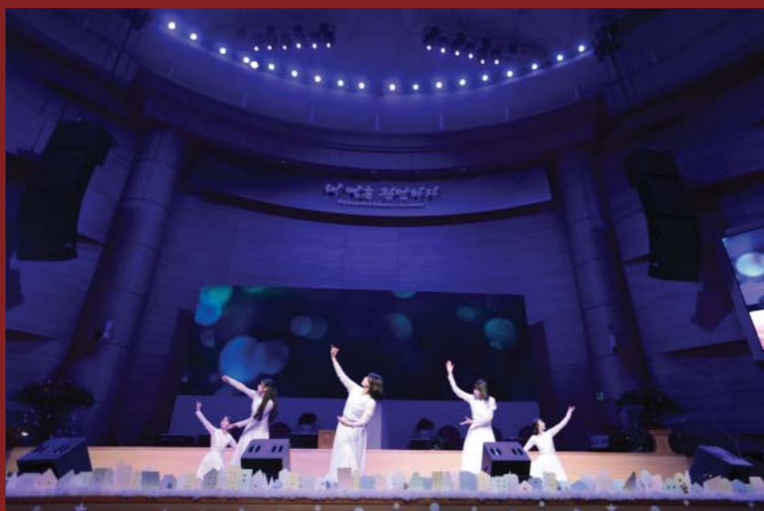
The Worship Team Performing