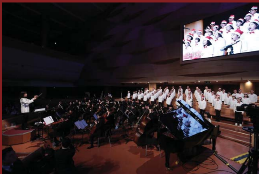
The Union Choir Praising