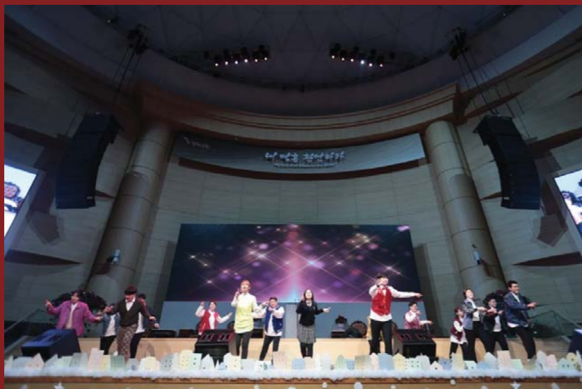
The Skit Drama