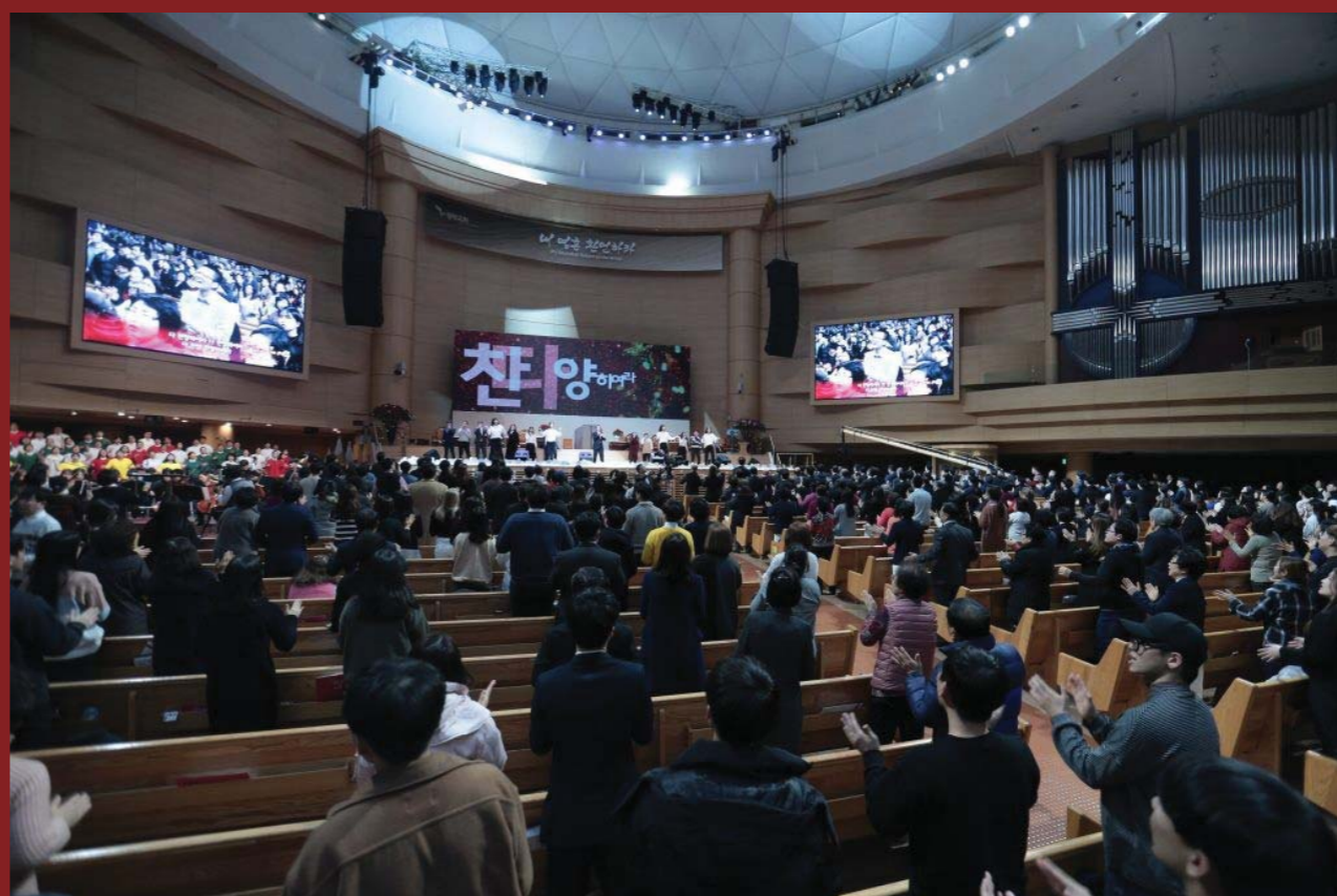
The Sungrak People Praising